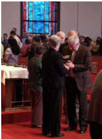
Commissioners receive communion prior to day's business.

Morning Worship, led by an awesome praise team and a beloved preacher, gave a centered focus to the assembly of pastors and elders gathered at Grace PC, Houston, to conduct the business of the day.