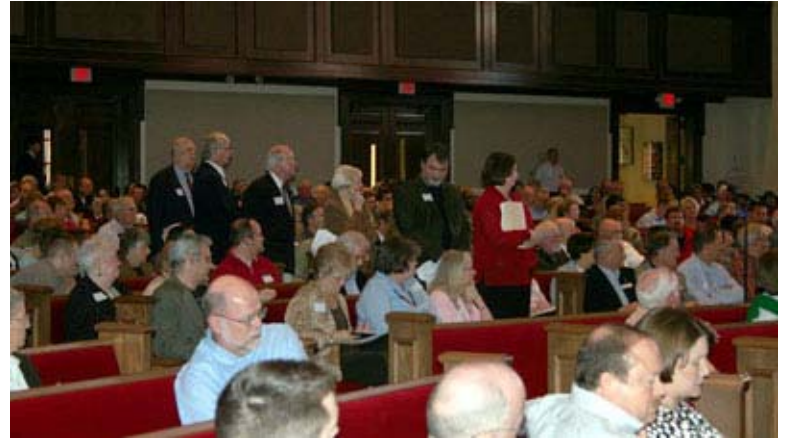
Commissioners listen respectfully to hour-long floor debate.